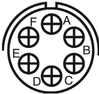
Fig. 1. The output connector.

tallic parts of the vacuum chamber in that the attached electrode system is located or to another reference potential.